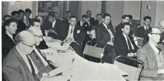
Above: Heating engineers from the various Districts of Area 1 and Area 2/3 during their Conference in Liverpool.

Staff Conferences held at Liverpool . . . .