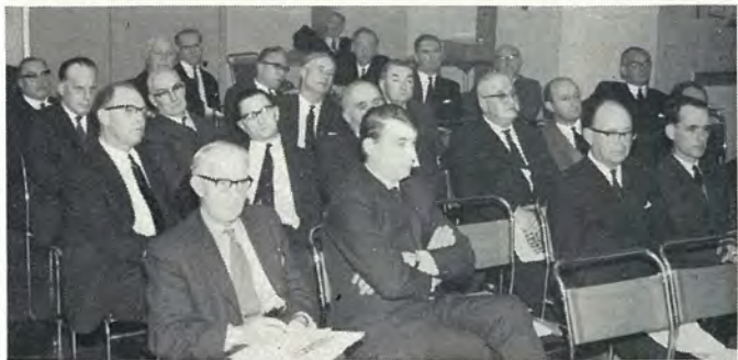
Below: MANWEB District Commercial Engineers, or their deputies, who attended at the Development Centre in Liverpool recently.

As the number of off-peak electric heating customers increases year by year, progress is also being made in the development of the latest forms of heating appliances.